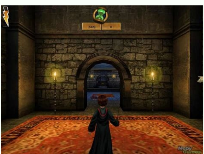
Harry potter and the chamber of secrets game soundtrack download. Harry potter and the chamber of secrets game soundtrack. Chamber of secrets game soundtrack download. Harry potter and the chamber of secrets pc game soundtrack.